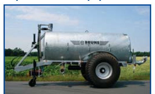
Singe axle: from 4,000 to 12,000 litres