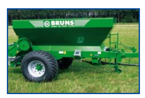
MBA 7.000, single axle