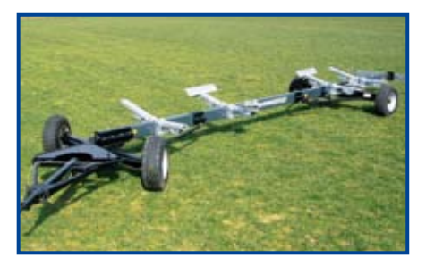
Model 96 ZB, 10.6 m - double axle 4 support bars