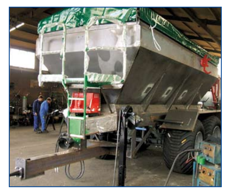
Custom manufacture of belt spreaders with volumes of up to 18,000 litres

An important focus of our Lindern location is selling innovative equipment and vehicles for efficient liquid manure spreading and lime distribution.