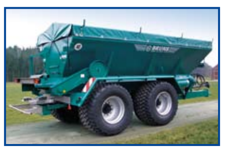
MBA 12.000, single and double axle