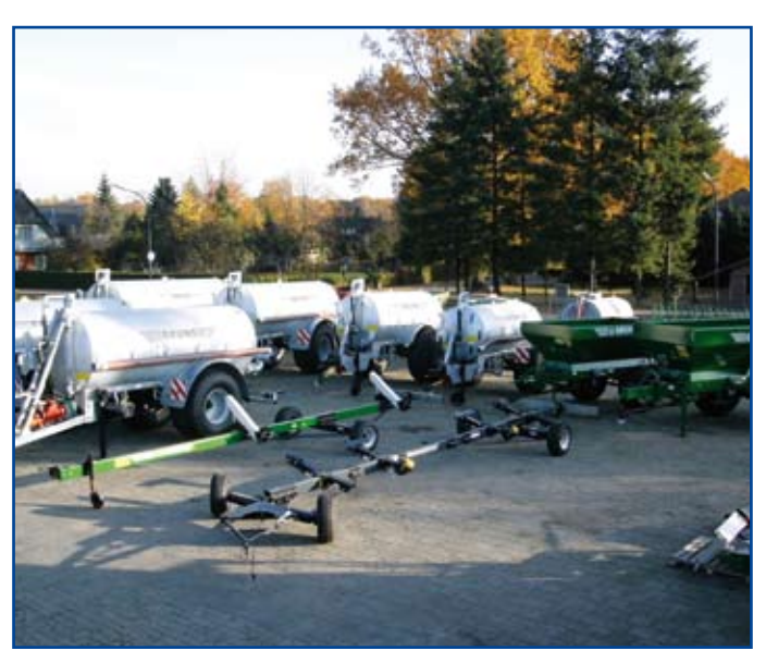
Excerpts from our broad range of high-quality products