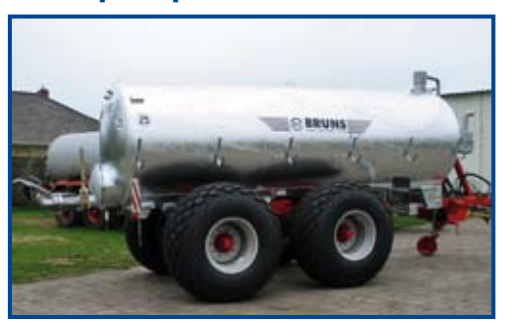
Double axle: from 6,000 to 18,000 litres