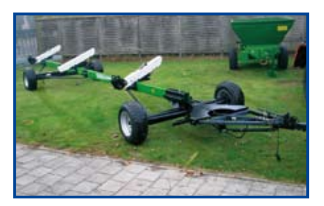
Model 96 Z, 9.6 m - double axle 3 support bars