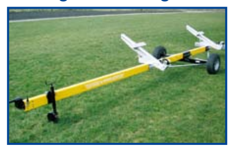
Model 76 E, 7.6 m - single axle carriage 2 support bars