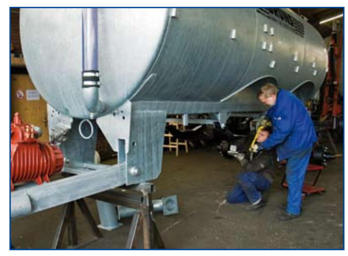
Manufacturing according to individual customer request.