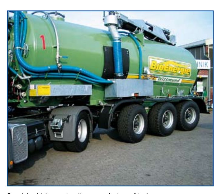
Special vehicle construction: manufacture of tanks for mounting on trucks

It is very important to us that all of our equipment meets the latest standards and is optimised for economic efficiency, roadworthiness, and easy handling.